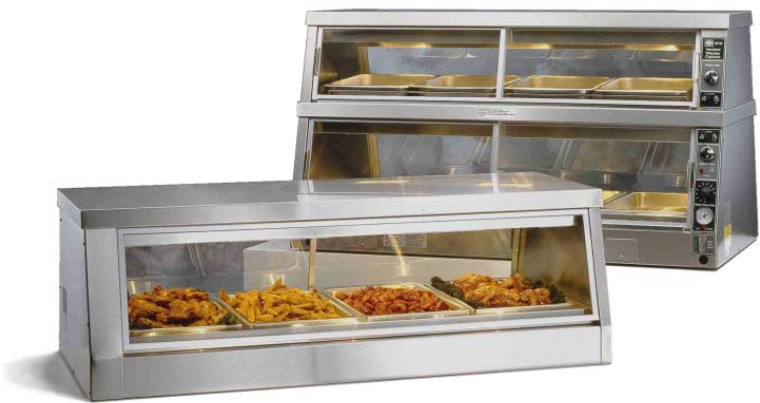
Display counter warmers, model CW-114 single tier and model CW-216 two-tier.

MODEL CW-114 single tier CW-216 two tier