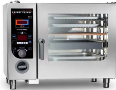
SmartCombi ESC/GSC-620 with capacity of 6 full-size sheet pans on grids or 12 full-size steam table pans.