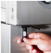
Easily access cooking data with USB port conveniently located at front of unit.