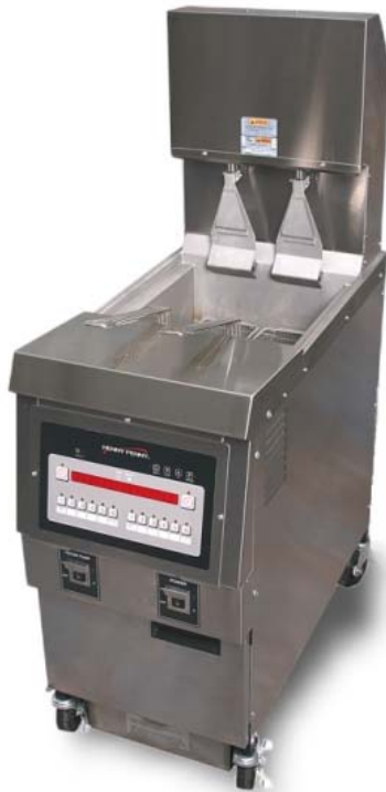
Auto lift open fryer, model OEA-321