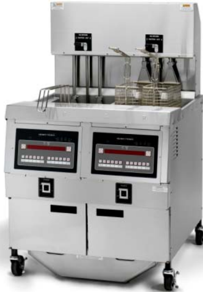
Two-well auto lift open fryer, model OEA-322

MODEL OEA-322 2-well electric OGA-322 2-well gas