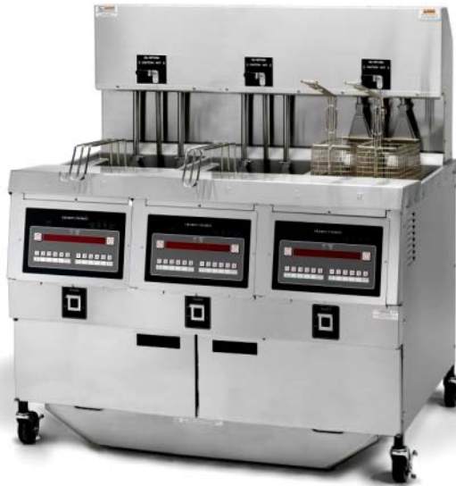
Three-well auto lift open fryer, model OEA-323

MODEL OEA-323 3-well electric OGA-323 3-well gas