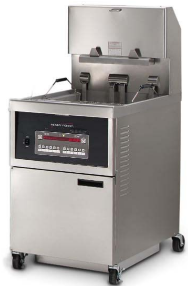
Large capacity auto lift open fryer, model OEA-341, shown with skim basket.