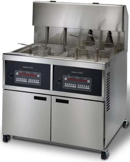
Two-well large capacity auto lift open fryer, model OEA-342.

MODEL OEA-342 2-well electric OGA-342 2-well gas