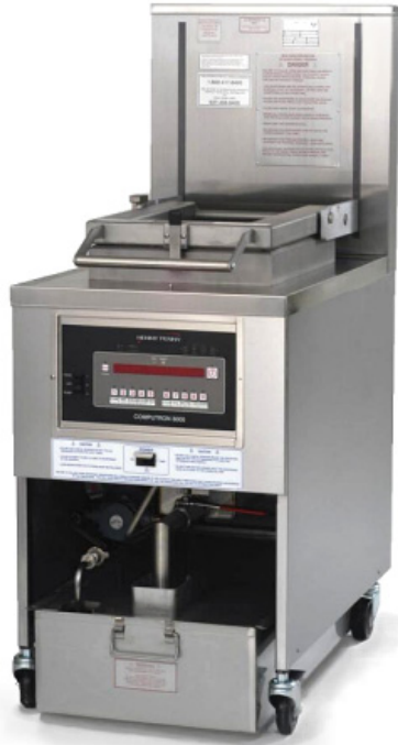
High volume 8-head electric open fryer, model OFE-291.