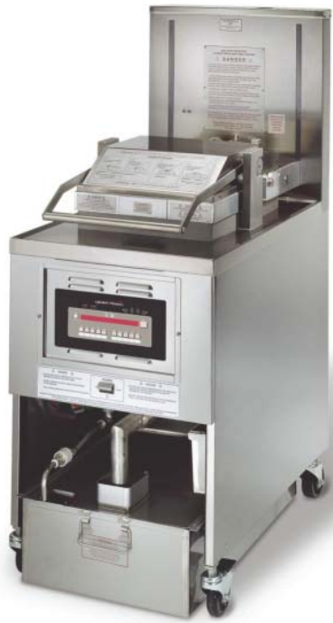
PFE-591 high volume 8-head electric pressure fryer.