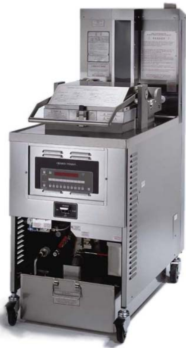
PFG-691 high volume 8-head gas pressure fryer