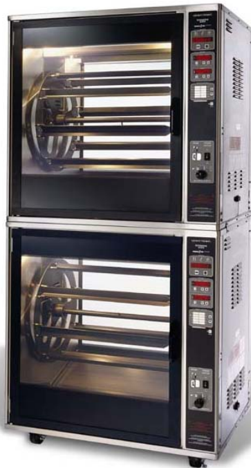
Stacked 16-spit rotisserie, model SCR-16