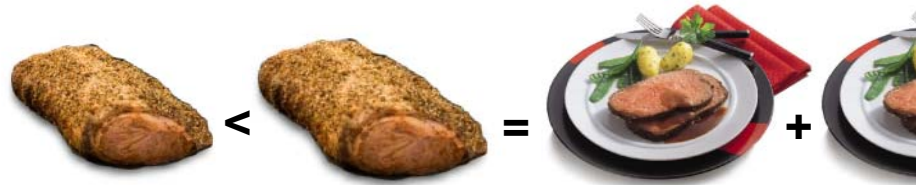
Less shrinkage in a combi can mean up to 30% more servings per roast!

Probably the best individual example of profit opportunities through combi cooking has to do with shrinkage of large roasts. Some combis have been shown to produce as little as 10 to 15% shrinkage, compared to 30% or more in regular ovens and even 18-20% in conventional slow-cook ovens. Further, Delta-T and slow roast cooking programs produce even core temperatures throughout each roast. High ticket items, such as Prime Rib, properly cooked in a combi can yield up to 30% more servings per roast .