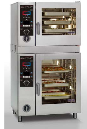
Save floor space and add flexibility by stacking two units.

Cooking good food is labor-intensive work. Much of that work, however, consists of checking on items, stirring, changing settings, combining separately cooked ingredients, adding or removing pan covers, turning or rearranging food as it cooks, etc. Combis have automated much of that work with multi-step cooking programs and the ability to create practically any ideal cooking climate. The result is that skilled labor has more time to plan menus, prepare complex items, manage the kitchen and consider strategic bottom line issues, such as energy conservation, supply chains or waste reduction. With programmable operation, the need for unskilled labor and supervision is reduced. Training costs are also minimized. Overnight cooking and automatic self-cleaning are other ways that a good combi can increase output while actually lowering labor costs.