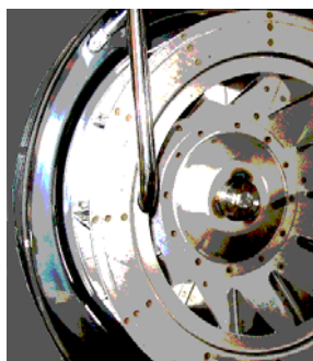
Fig. 1—Advanced Steam Technology

Above: Hot water from heat exchanger is regulated to spray on rim of high speed fan wheel. Water is misted to steam immediately.