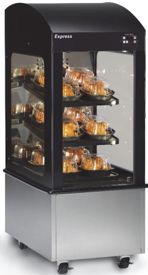
EPC 200 express profit center 2-ft unit on standard casters

Henny Penny express profit centers present an excellent solution for retailers seeking to expand hot food impulse sales and cross-merchandising opportunities.