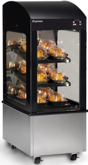
EPC 200 express profit center 2-ft unit on standard casters

Henny Penny express profit centers present an excellent solution for retailers seeking to expand hot food impulse sales and cross-merchandising opportunities.