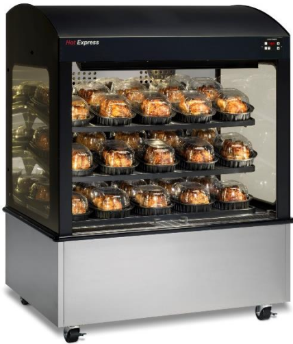
EPC 400 Express profit center short profile 4-ft unit on available casters

Henny Penny express profit centers present an excellent solution for retailers seeking to expand hot food impulse sales and cross-merchandising opportunities.