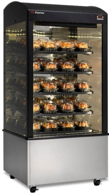
EPC 301 express profit center tall profile 3-ft unit on available casters

Henny Penny express profit centers present an excellent solution for retailers seeking to expand hot food impulse sales and cross-merchandising opportunities.