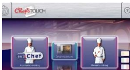
Chef's Touch control: Just tap and swipe to run built-in apps

Removable tilt-resistant rails accept full-size steam table pans or half-size sheet pans and grids.