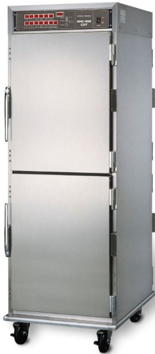
HHC 900 full-size heated holding cabinet with Countdown Timer control

Henny Penny heated holding cabinets keep hot foods safe and appetizing prior to serving.