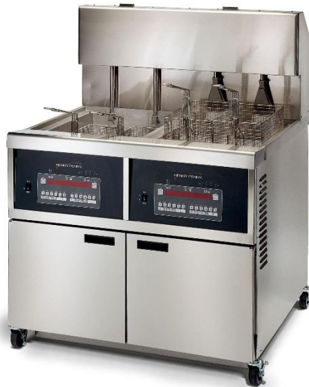
OEA 342 2-well large capacity auto lift electric open fryer

OEA 341 1-well electric OEA 342 2-well electric