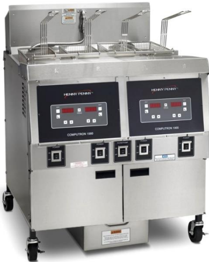
OFE 322 2-well electric open fryer with split vats and Computron™ 1000 control

Henny Penny open fryers offer high-volume, integral multi-well frying with programmable operation, oil management functions and fast, easy filtration.